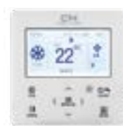
Wired Controller XK76