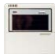
Wired Controller CE50-24/E