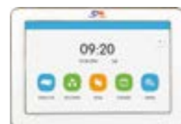
Wired Controller CE52-24/F